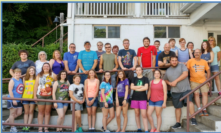
Mission Team members from JCS

Berkey Church had the privilege to go again and work beside the folks in Lost Creek, Kentucky, this past June. We stayed at the Riverside Christian School, working there during the days, and then held a Vacation Bible School up in the "holler" at Caney Creek Mennonite Church each evening. We have been blessed to be partners in the ministry with these organizations and continue to relish the opportunity to foster relationships between the church and the community there in the "holler." One of the most exciting things work-wise we did was the transplanting of several hundred plants. We dug them up and replanted them in over a dozen different homes as part of an outreach visitation program. It was hot and hard and dirty, but it was also supremely rewarding as we were able to bless and do home visits like we have never been able to in all the years we have been serving there. God continues to have great plans for Lost Creek and for the Caney Creek Holler, and we are blessed to walk beside them in the ministry.